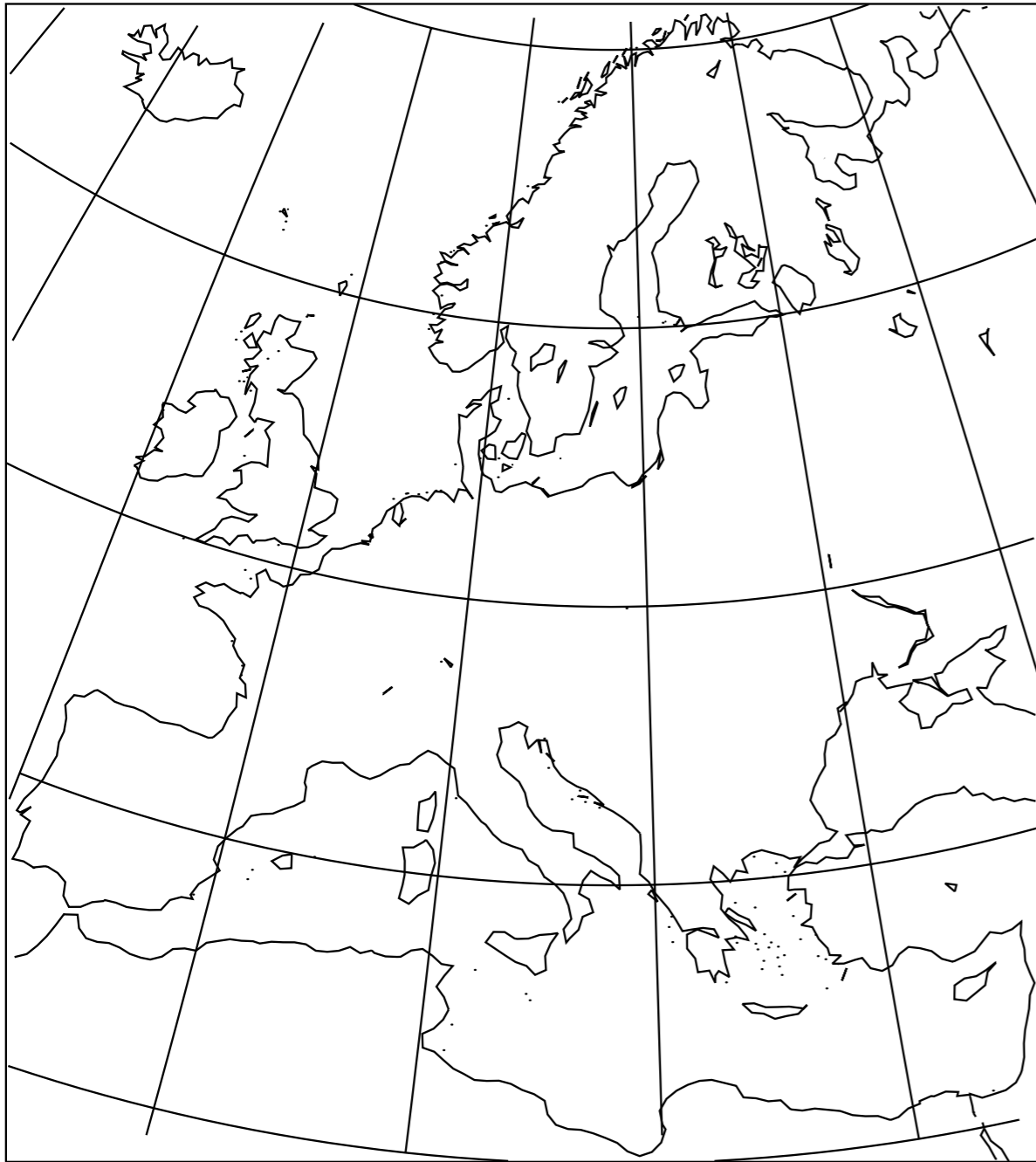
0.22 degree (25km) grid mesh

eqlon = 18.0000, eqlat = 50.7500, pollon = -162.000, pollat = 39.2500 startlon = -21.7200, startlat = -20.6800, endlon = 15.4600, endlat = 20.9000 ie= 170, je = 190, delta= 0.220000, NG= 32300, NG10= 39900